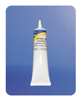
NYE® DIELECTRIC GREASE