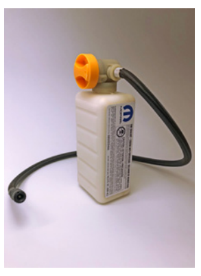
Tire Service Kit 05181361AE